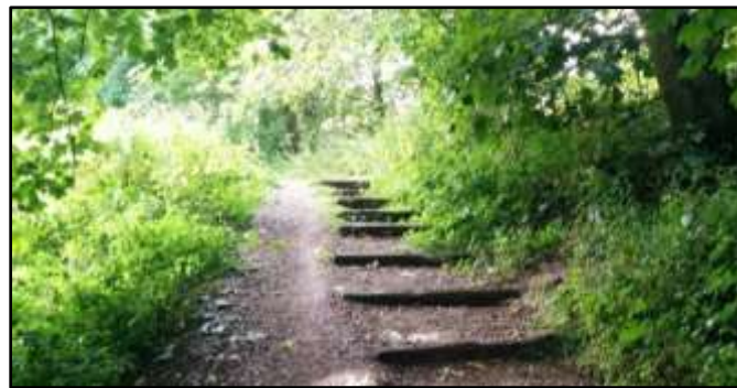
Image 8: above, Arnold Grove

2.6 Open space is a vital component of the Borough’s overall ‘Green Infrastructure’. It is also the most accessible Green Infrastructure. Accompanying the Open Space Strategy review is a new Green Infrastructure Strategy for Newcastle under Lyme. The Green Infrastructure Strategy is a separate document. In addition to the role of open space for recreation, play and its aesthetic