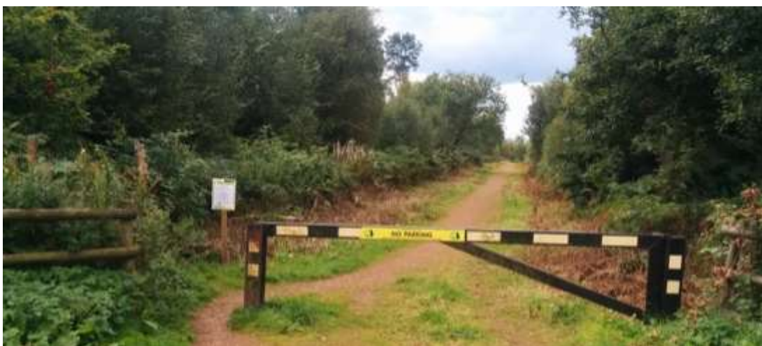
Image 9: above, accessible woodland is of high recreational value and important for biodiversity