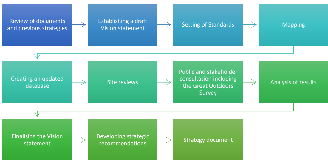
Figure 1: above; the main stages of undertaking the Newcastle under Lyme Open Space review.

Our vision is to maintain the traditions and quality of the Borough's open space for the continued enjoyment, health and recreation of residents and visitors. We will do this by, prioritising quality over quantity, celebrating our green heritage, giving space to nature and seeking innovative ways to fund our work. We will know we have succeeded if we hand over the Borough's open spaces to the next generation and they are able to enjoy its benefits as we have.