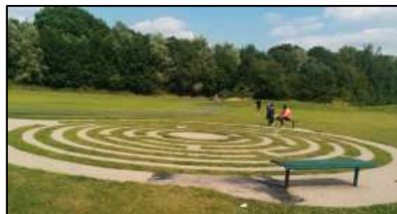
Image 7: above, The Wammy

2.3 Work undertaken in preparing the Open Space Strategy review has shown that the quality of open space in the Borough is generally good or very good. There are some areas that are deficient in quality and require improvement; however, in the opinion of the consultants these are fewer than might normally be expected in a review. Hence it is possible to say that the management of open space is at the time of the review good and that the sites are consequently of a good quality too. This does not extend to all buildings located in open space, some of which are clearly a challenge to maintain and their original purposes have long since passed. New methods are needed for managing these and where these challenges cannot be addressed removal may be the only remaining option.