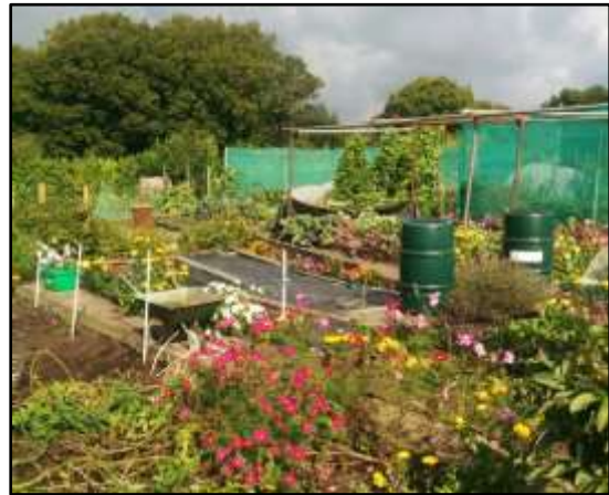
Image 6: above, Allotments at Loggerheads

2.2 The Borough has distinct urban settlements in the towns of Newcastle under Lyme and Kisdgrove but also an extensive rural area, interspersed with smaller settlements and villages. The open space in the towns typically reflects the overall urban structure with town parks, amenity grassland and playing fields dominating the open space. Generally, access to these areas is good. In rural areas natural green space dominates open space, however access to natural green space is variable and this limits the recreational potential in some instances.